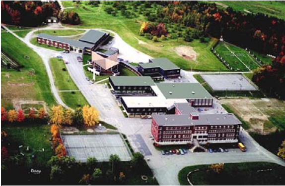
Bromptonville High School

The 2004 Reunion of the Association of the Choquet-te of America took place on Saturday August 7 th , 2004 at the Bromptonville High School located in the Brompton District of the City of Sherbrooke.