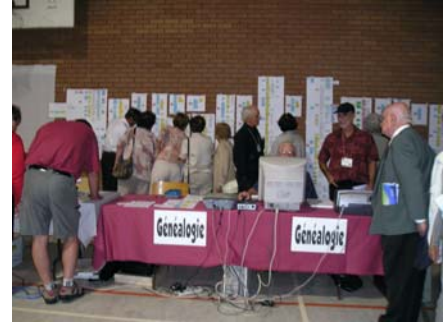
People looking for the chart of their ascendants