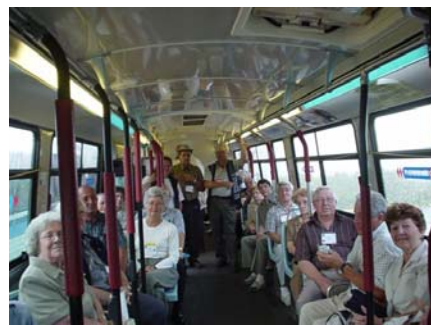
The Choquettes enjoying the guided tour of the city of Sherbrooke